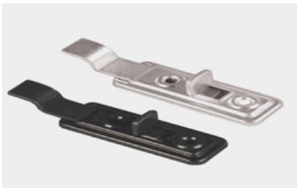
Ebco M4 Connecting Screw 33mm