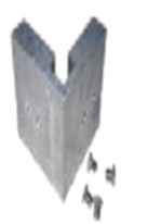
Taiton Aluminium Angle Bracket with Screws