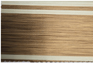
Vista Blinds Shade No ZV06