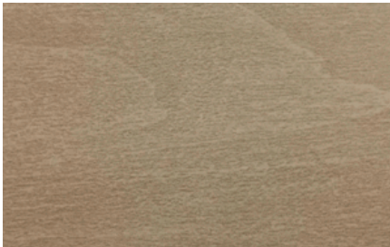
Carpet For Living Room