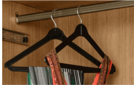
Ebco Bracket for Wardrobe Hanger Rail